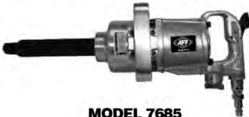
MODEL 7685 1" Impact Wrench