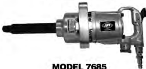
MODEL 7685 1" Impact Wrench